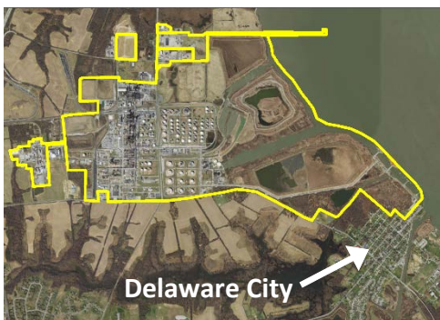
Six of the sites (outlined in yellow above) are located just northwest of Delaware City.

Heavy industrial development are facilities that use structures like smokestacks, tanks, chemical processing equipment, and waste-treatment ponds to run their business. They usually take up more than 20 acres of land. For example, a chemical manufacturing plant is heavy industrial development. It should be noted that not all heavy industrial development is allowed in the Coastal Zone: New oil refineries, incinerators, steel plants, and liquefied natural gas terminals are still not allowed, even on the 14 sites.