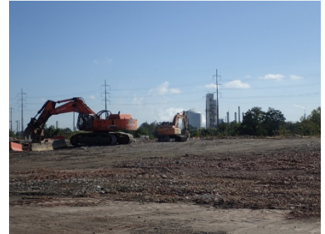
Former EVRAZ/Citi Steel site in Claymont, one of the 14 sites where new heavy industrial development could happen.

Heavy industrial development on any of these sites must be approved by DNREC under a new permit called a "conversion permit". DNREC is in the process of writing new regulations for conversion permits and is reaching out to communities for input.