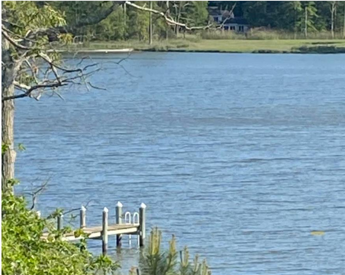
Current View from Rear of Eklund Home