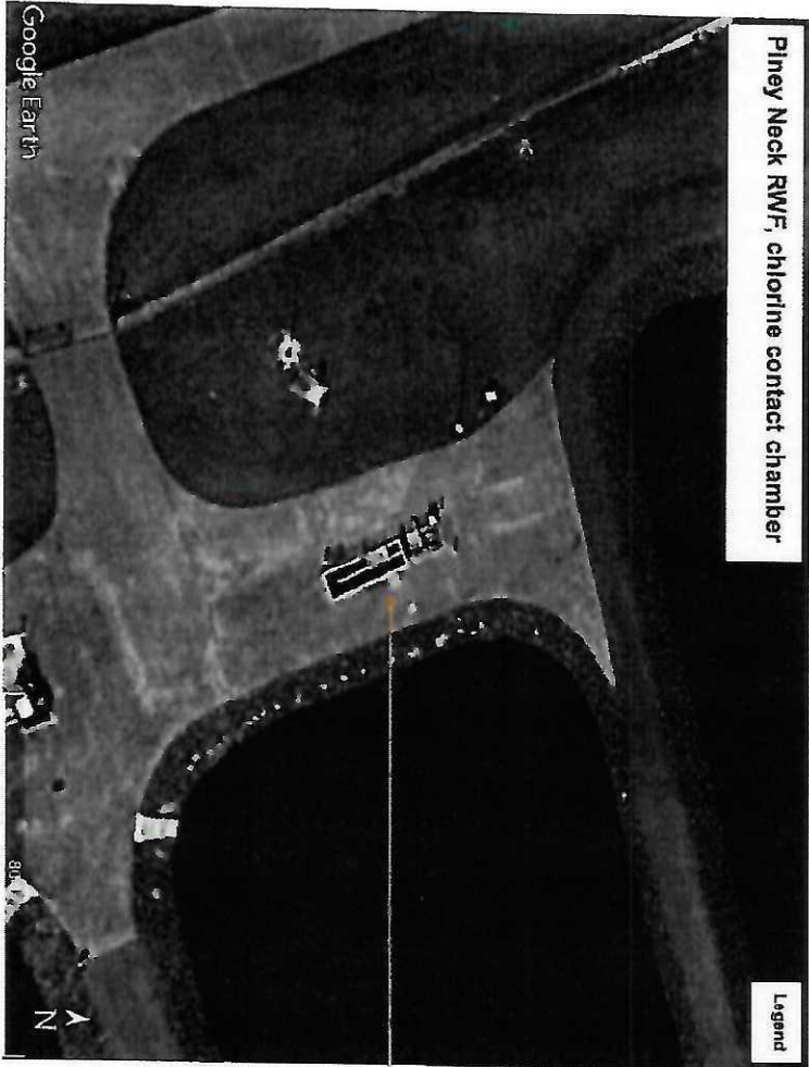
Chlorine contact chamber