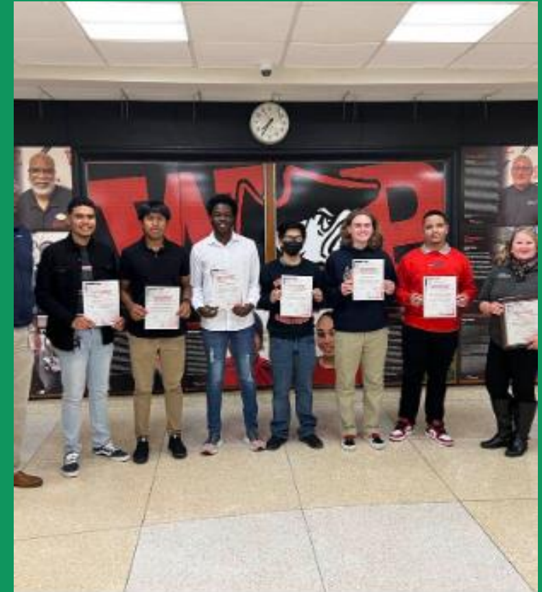
Colonial School District Partnership Recognition