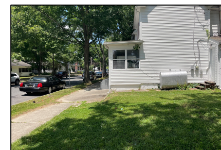
7. Adjoining N