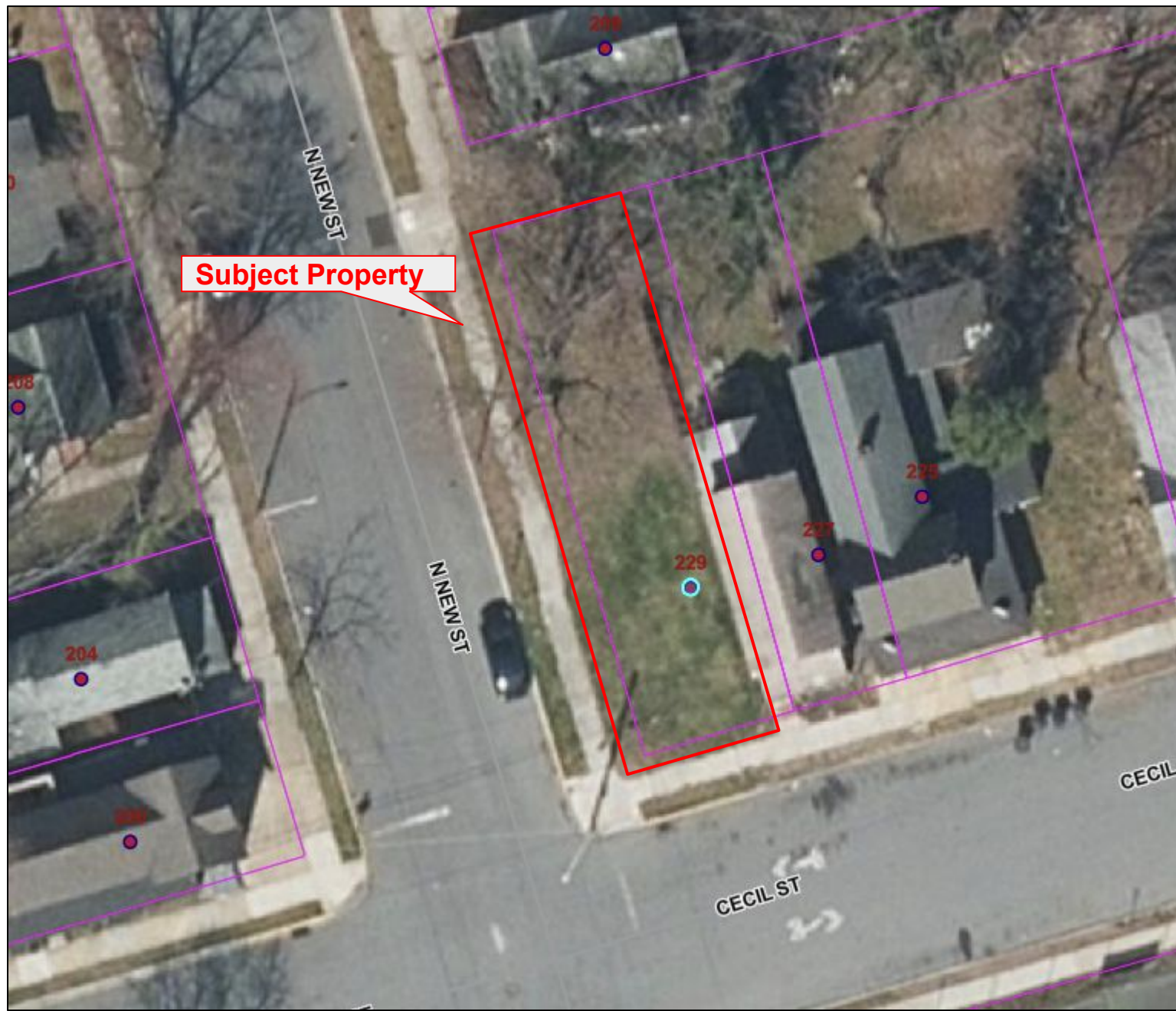
1 Subject Property Boundaries