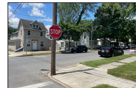
4. SW boundary