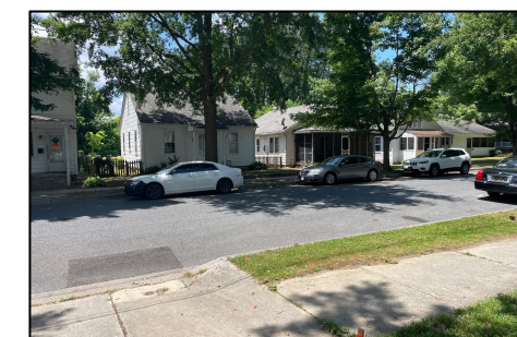
8. Adjoining NW (N New St)