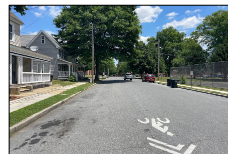
6. Adjoining SE (Cecil St)