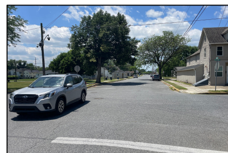
5. Adjoining SW (Cecil St)