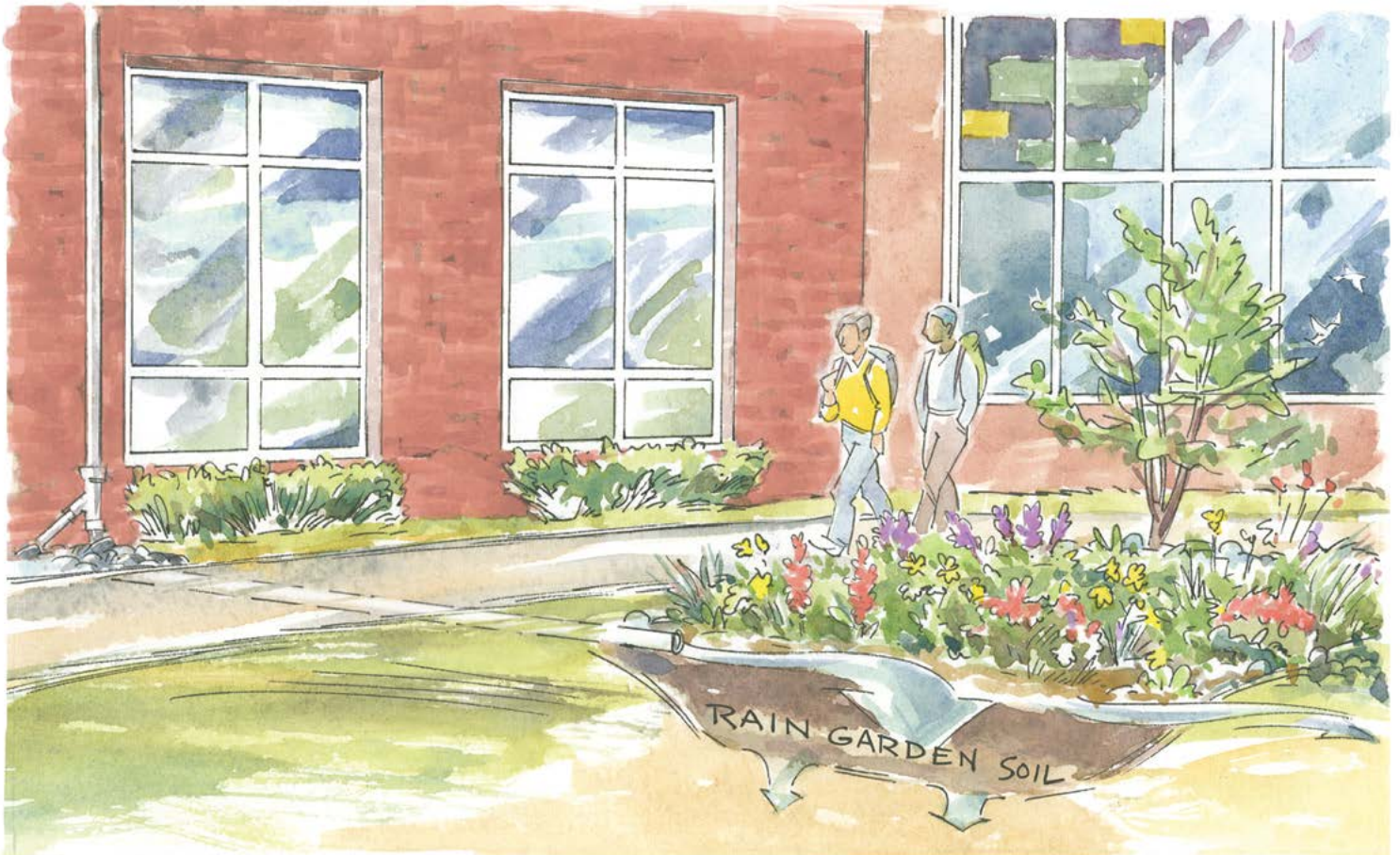
ILLUSTRATION: Jeffery Mathison

A rain garden is a shallow depression with vegetation that allows the rainwater and stormwater to collect and infiltrate into the ground. Typically installed in community and residential areas, rain gardens are designed to hold rainwater in place. Rain gardens and bioretention systems collect and filter stormwater through layers of mulch, soil, and plant root systems where pollutants are retained and absorbed using a specially engineered soil media.