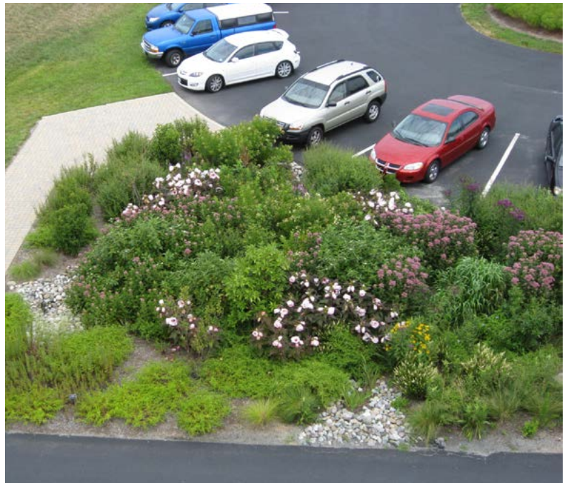
RAIN GARDEN, UD LEWES CAMPUS The rain garden at the University of Delaware's Hugh R. Sharp Campus in Lewes was designed to provide infiltration of surface water runoff from the adjacent parking area. The garden was installed in 2010 with assistance from Delaware Sea Grant and DNREC.