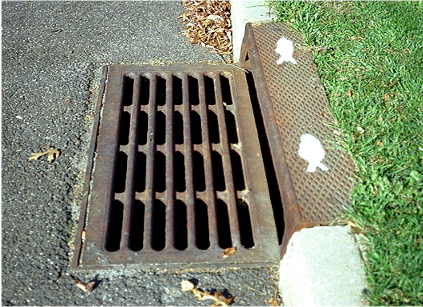
Figure 8. This is an example of a storm drain which drains into stream or surface water body.