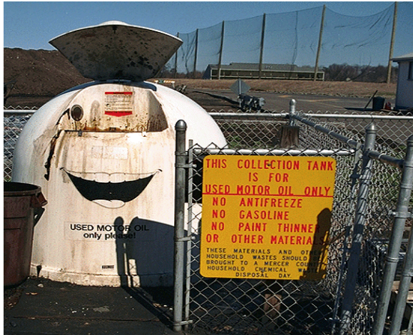
Figure 5. Used Oil Recycling Tank -No Antifreeze, Gasoline, Paint Thinners or other Materials

Additional Information can be found in the Appendix. See the following documents: List of Hazardous Waste Transporters Spill Notification