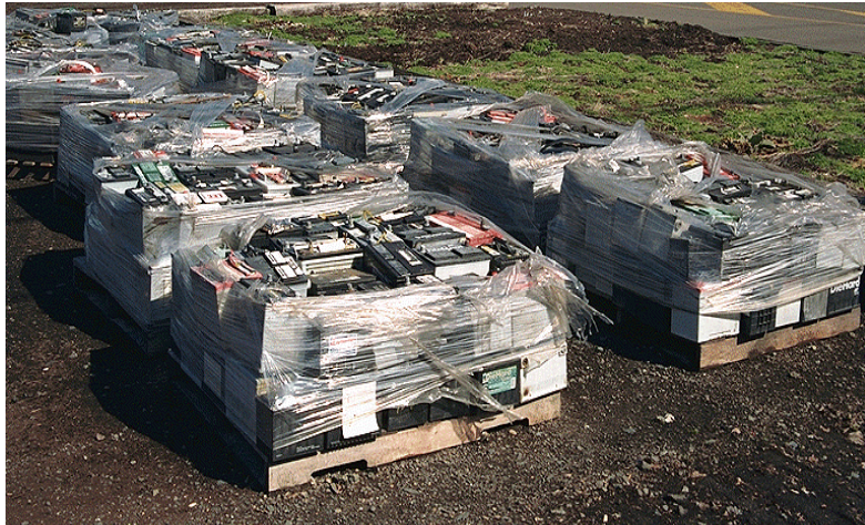
Figure 4: Poor Storage Practice: Batteries stored in an area with no containment and with lack of cover.