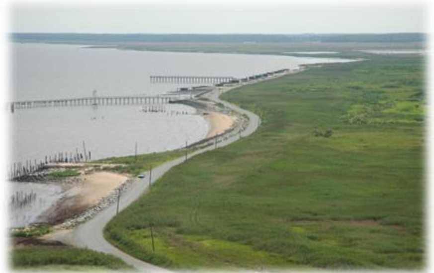
DE Storage and Pipeline Site, Port Mahon Road, Kent County