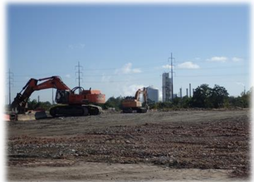
Demolition at the Former Citi Steel site, Oct 2017