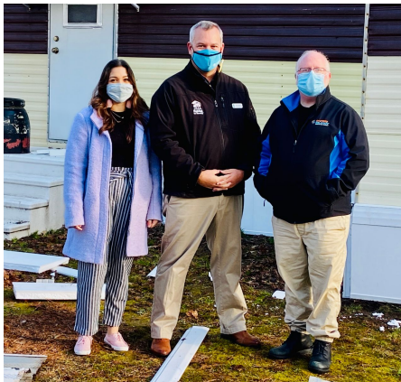
Insulated Skirting Program for Manufactured Homes with Sussex County Habitat for Humanity. Delmar, DE.