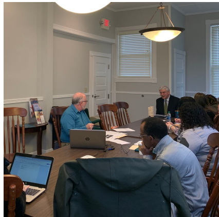
In-person and virtual workshops were held to connect hundreds of groups across Delaware. Large-scale workshops were held in each county in February 2020. Community-scale workshops were held virtually in April 2020.