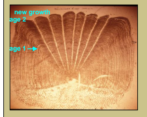
Magnifying a fish scale to determine age & growth rates.

Largemouth bass scale with growth rings marked (12 inches, 2 years old).