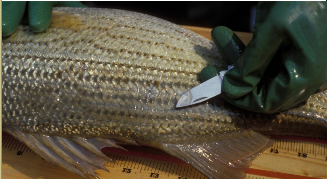
Using a pocket knife to remove scales from a striped bass.

Since the striped bass survey on the Delaware River is conducted during the spring spawning season, sex is easily determined. Often fish growth differs between males and females, as is the case with striped bass. Age and growth data are especially important when managing a fish species, like the striped bass, which migrates in and out of Delaware waters and is targeted by both recreational and commercial fishermen. Fish age and growth information is very important for quality management of Delaware's fish populations.