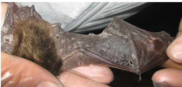
DE little brown bat with heavy wing scarring.