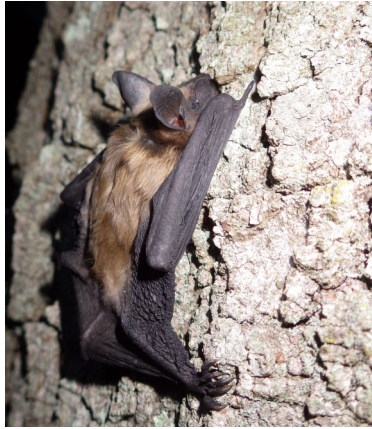
Healthy big brown bat pup in DE.