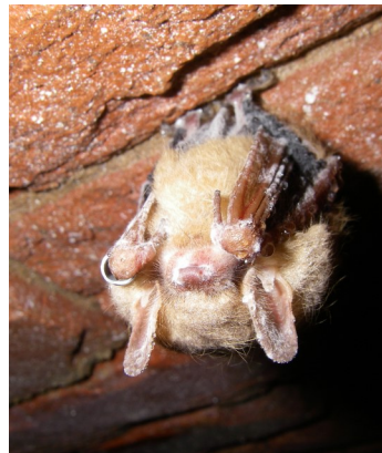
DE tri-colored bat with WNS.

White-nose syndrome (WNS) is a disease causing mass die-offs of bats at hibernation sites, with mortality rates of 90–100% at some locations. Confirmed in the United States in 2006, the U.S. Fish and Wildlife Service estimates 5.6–6.7 million bats died from WNS in the first 7 years. Bats affected by WNS have been detected in 33 U.S. states and seven Canada provinces. The fungus is also present in Europe and China; however, population-level effects appear to be less severe in these locations.