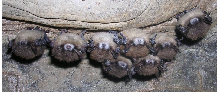
Little brown bats in New York with WNS.