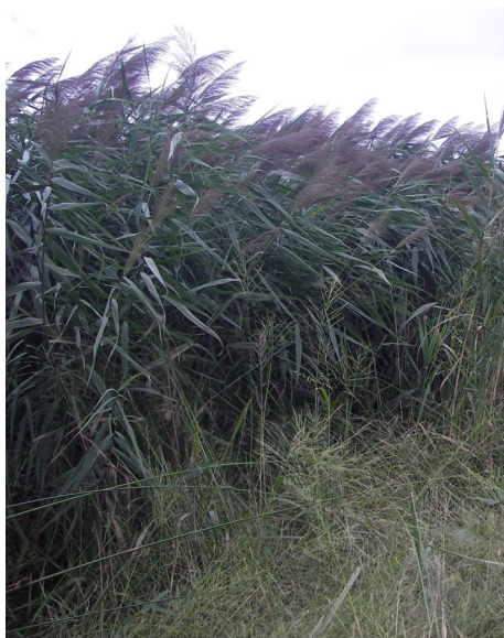
Common reed ( Phragmites australis )