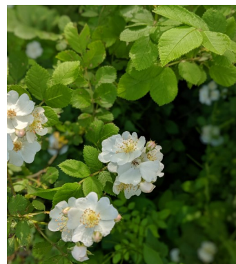
Multiflora rose ( Rosa multiflora )