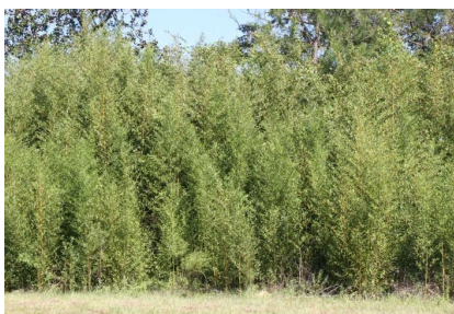
Imported bamboo