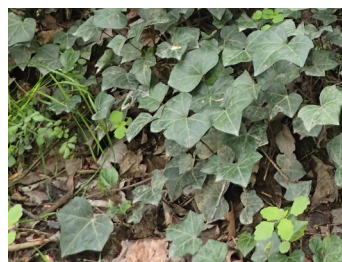
English ivy ( Hedera helix )