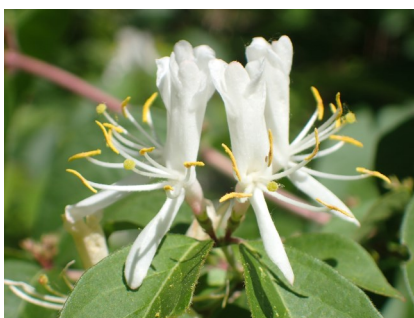
Japanese honeysuckle ( Lonicera japonica )